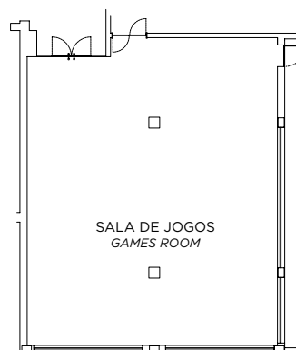
PISO | FLOOR 0